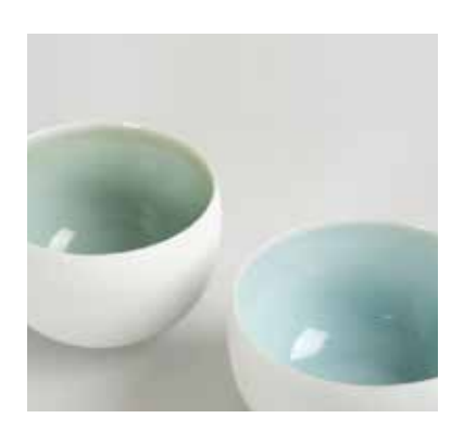
paintings + furniture + jewellery + objects