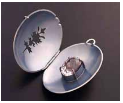
unique tasmanian art + design